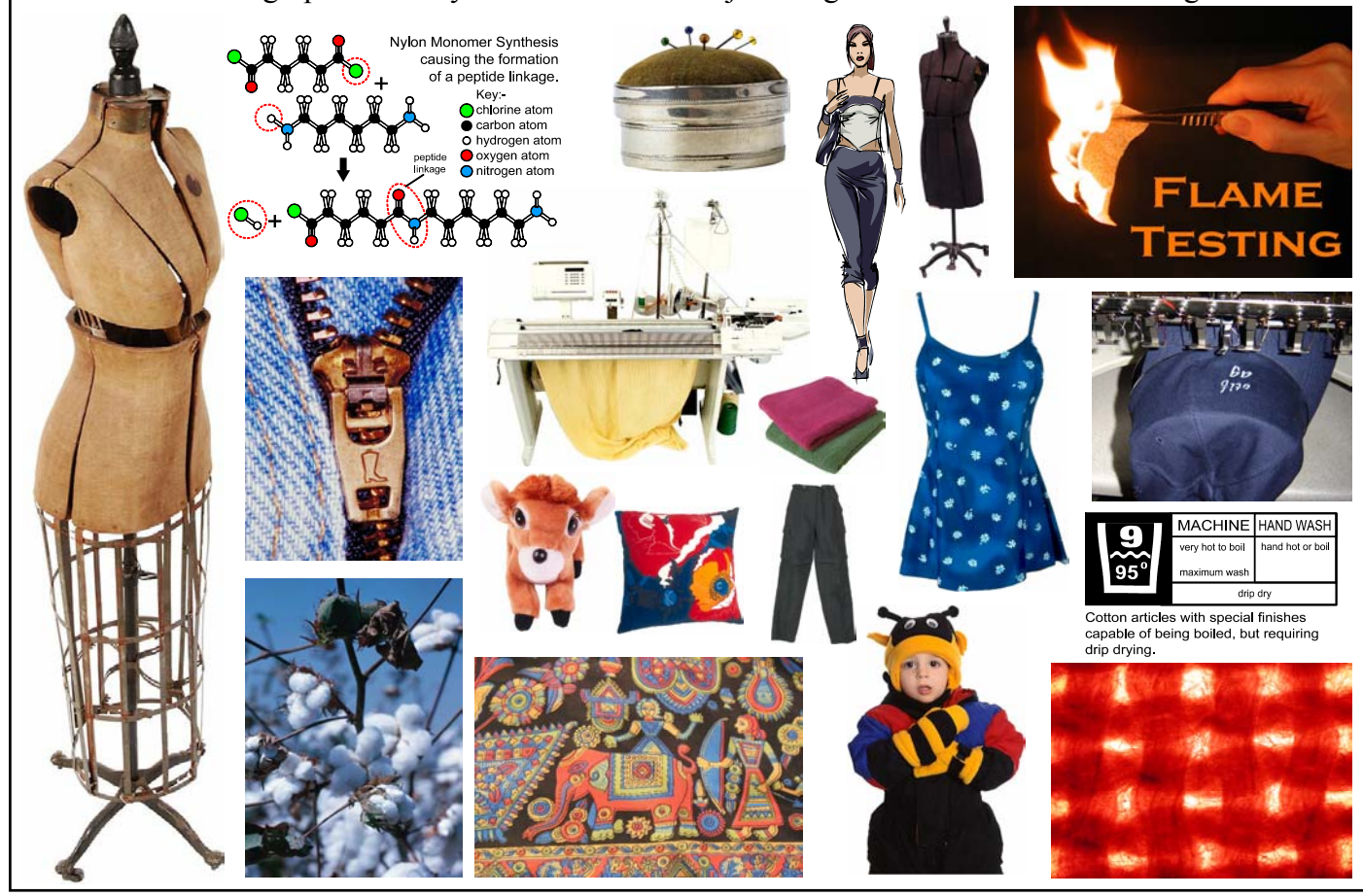
S.S.E.R. Ltd. Registered in England & Wales. Company Registration No. 3230968.

This superb collection of over 6,600 quality graphics is now available for standalone or network installation. An optional online subscription facilitates access to the images for both students and staff (at school and at home) and gives immediate access to new images. It is now easy to produce or enhance lesson/revision notes, projects, posters, presentations, worksheets, web pages, etc. The integral graphic viewer allows you to easily view the images and then simply copy and paste your selection into any other application. Textiles & Fashion Graphics is just one of over 30 unique sets of images in the SSER educational graphics library - to see the full subject range visit www.EducationImages.com.