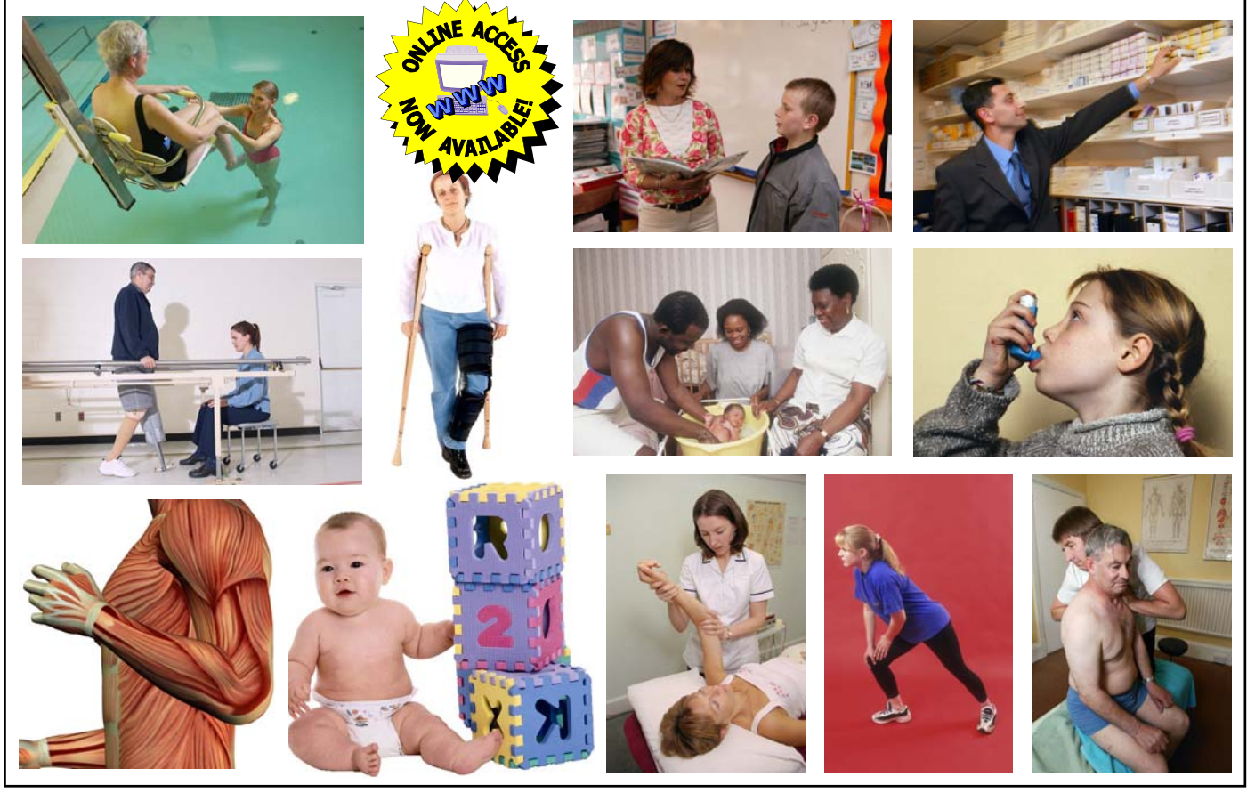
S.S.E.R. Ltd. Registered in England & Wales. Company Registration No. 3230968.

This superb collection of over 7,900 quality graphics is now available for standalone or network installation. An optional online subscription facilitates access to the images for both students and staff (at school and at home) and gives immediate access to new images. It is now easy to produce or enhance lesson/revision notes, projects, posters, presentations, worksheets, web pages, etc. The integral graphic viewer allows you to easily view the images and then simply copy and paste your selection into any other application. Health & Social Care Graphics is just one of over 30 unique sets of images in the SSER educational graphics library - to see the full subject range visit www.EducationImages.com.